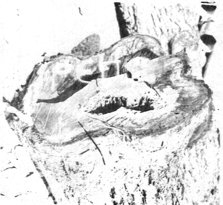
End of log - Reversed photo

The identification was confirmed by matching marks on the stump and log where the chain saw was shifted in position and direction of cuts, and by the patterns of the rotted and worm eaten areas